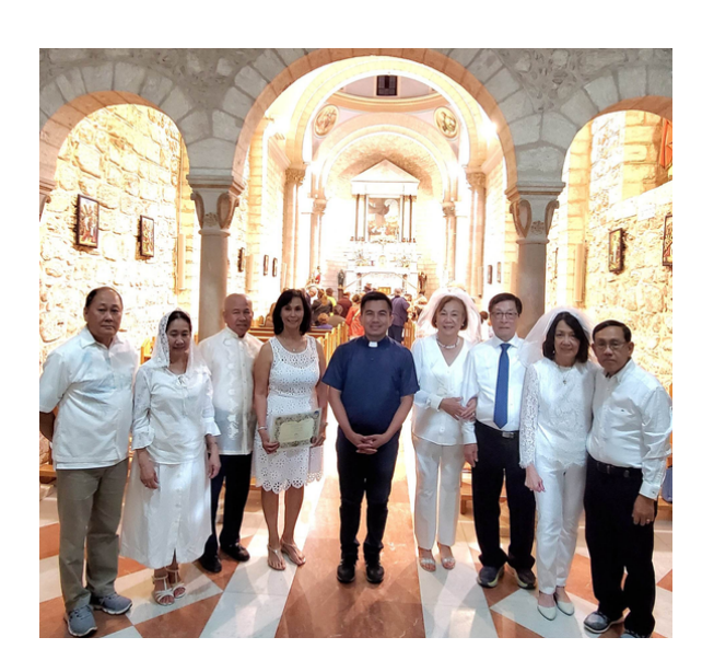
Renewal of Wedding Vows at Church of Cana