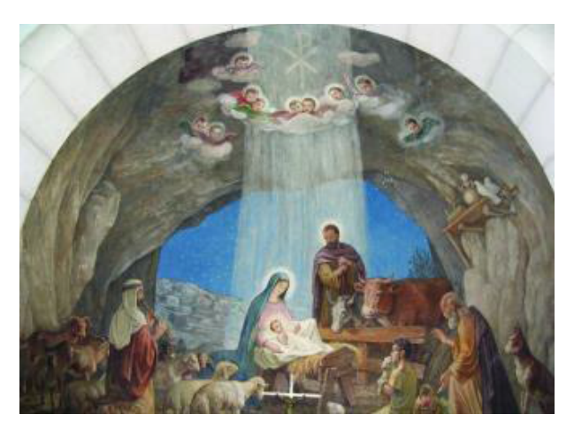
Church at Shepherds Fields