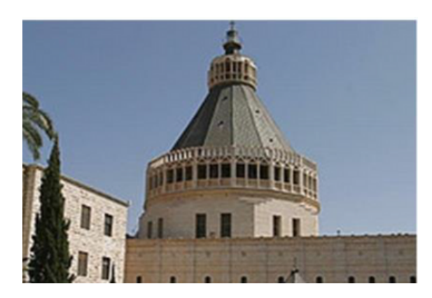
Basilica of Annunciation