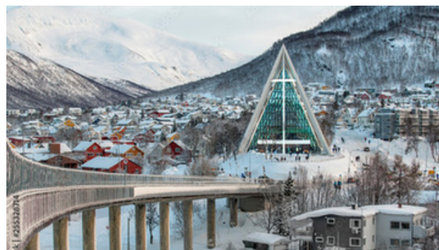
The Arctic Cathedral

In Tromsø there is always a good chance of seeing the northern lights in the period September until April. These are the months of the year when it is dark enough outside to see the lights dance across the sky.