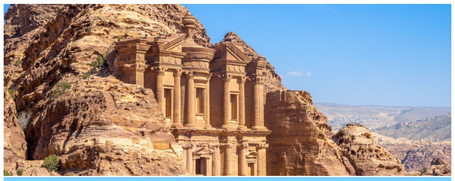
OPTIONAL POST TOUR JORDAN ITINERARY: Nov. 16 - 18, 2024