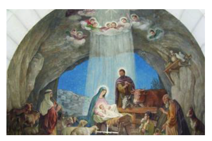
Church at Shepherds Fields