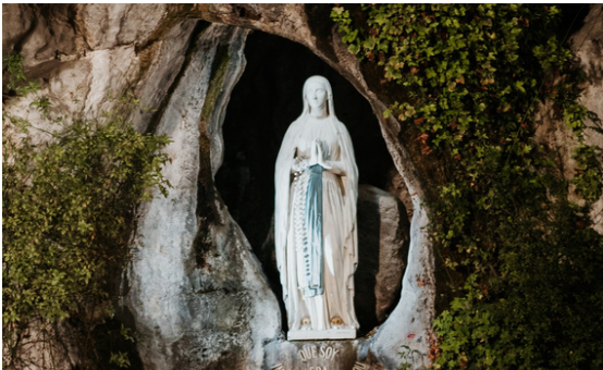
Our Lady of Lourdes Grotto

This morning we enjoy a walking tour of Carcassonne. Next we drive to Toulouse for a visit of the Church of Les Jacobins where we will visit the tomb of Saint Thomas Aquinas, a Doctor of the Church. Following Mass, we continue on to Lourdes, where in 1858, Mary appeared to young Bernadette Soubirous. Upon our arrival in Lourdes we check into our hotel prior to walking to the Sanctuary for an introduction to the Shrine. Following dinner, we participate in this evening's Candlelight Rosary Procession. Overnight in Lourdes.