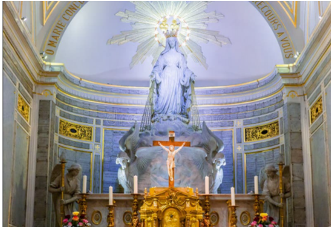
Chapel of Miraculous Medal, Paris

Here we see the incorrupt body of St. Catherine as well as the body of Saint Louise de Marillac, who founded the Daughters of Charity with Saint Vincent de Paul.