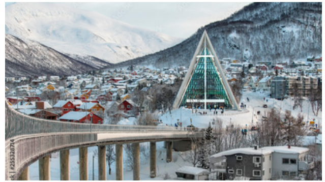
The Arctic Cathedral

In Tromsø there is always a good chance of seeing the northern lights in the period September until April. These are the months of the year when it is dark enough outside to see the lights dance across the sky.