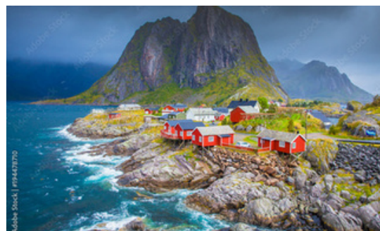
Bergen to Lofoten

After the sightseeing tour in Bergin, transfer to the airport (about 5pm ) and take a flight to Harstad/Narvik. Meet your driver in Narvik ariport and drive to Svoalver/Lofoten and arriving around 8pm. Dinner and overnight in Svoalver.