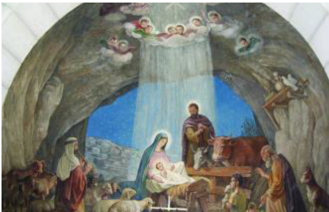
Church at Shepherds Fields