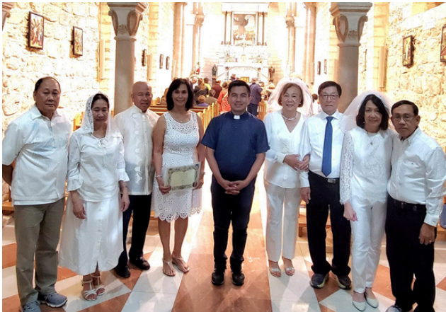
Renewal of Marriage Vows at the Church of Cana