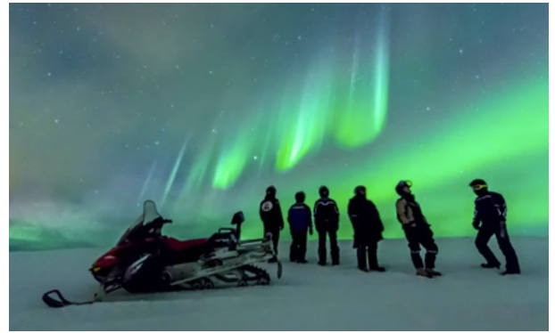
Alta – The City of the Northern Lights