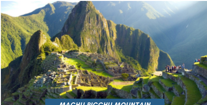
MACHU PICCHU MOUNTAIN

Check in: 15:00 hrs Check out: 12:00 hrs