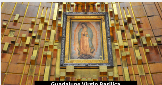
Guadalupe Virgin Basilica

We will also take a panoramic visit to the "Templo Mayor" archaeological excavations and its Guatemala street and its hundreds of religious articles stores; The church and square of Santo Domingo (Saint Dominic), the first university and the seat of the holy inquisition back to the colonial times; we will also visit the San Francisco and La Profesa churches from the XVI century and drive through Tacuba street to admire its ancient buildings, squares and monuments, the square of Santa Veracruz (Holy Cross) and its leaning churches and stop at San Hipolito (Saint Hipolite) parish church for a visit and see its famous image of San Judas Tadeo (Saint Judas Tadeous), that has converted it to be the second most important and most visited religious place in the city after the Guadalupe Basilica.