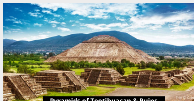
Pyramids of Teotihuacan & Ruins

We drive to downtown to visit the HOLY MARY'S ASSUMPTION METROPOLITAN CATHEDRAL , named “Our Lady of Assumption”, located on the Zocalo, the main square. Inside we will visit the Chapel of the Miraculous Cross of Poison. Originally made of white marble, the cross miraculously turned black from absorbing poison placed on it intended to kill the Bishop who traditionally kissed the feet of the cross every day at mass. It is the first cathedral built in the Americas, along two hundred years, therefore incorporating different architectural styles, such as Herrerian and Baroque, among others.