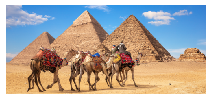
DAY 04: Oct. 27, 2023 - ALEXANDRIA DAY TOUR

After breakfast, drive to Alexandria from Cairo. Visit the CataComb of Kom El-Shokafa. This majestic Roman burial site includes inside some family tombs that reveal the merging of the Egyptian & Roman art and architecture and most importantly, it is considered one of the Seven Wonders of the Middle Ages. You will find there a collection of Alexandrian tombs and some interesting archeological objects of the Pharaonic funeral cult and it is really a great adventure to get in a historical place like this.