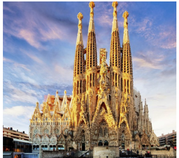
Sagrada de Familia