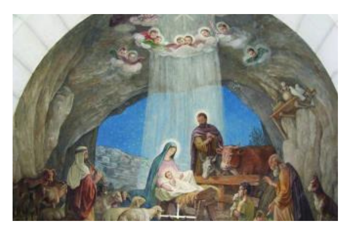
Church at Shepherds Fields