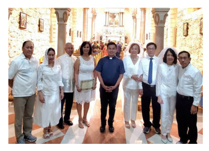
Renewal of Marriage Vows at the Church of Cana